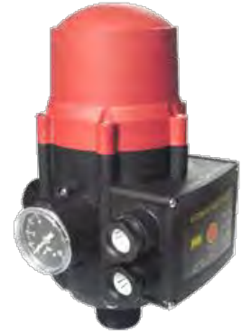
PS02B Type B (Pressure Adjustable: 1.5-3.2bar)