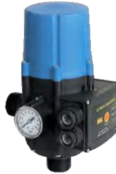
PS02A Type A